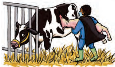
The veterinarian is operating on a mother cow to deliver a baby calf!