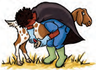
The veterinarian is trimming the goat's hooves!