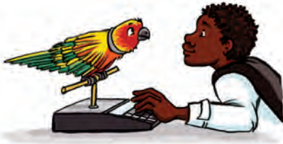
The veterinarian is using a scale to weigh the parrot!