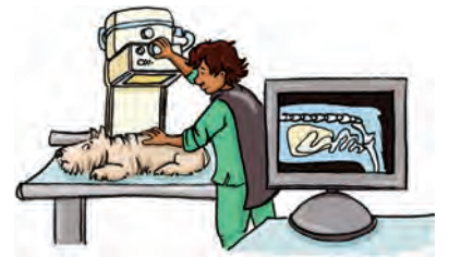
The veterinarian is taking a radiograph of a dog that ate a sock!