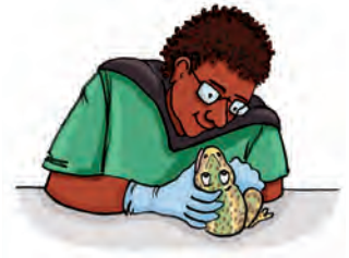
The veterinarian is examining a pet frog!