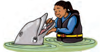
The veterinarian is checking the dolphin's teeth!