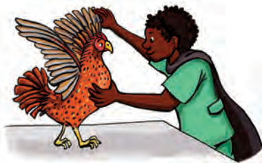
The veterinarian is examining a pet chicken to make sure it is healthy!