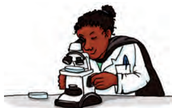
The veterinarian is discovering new vaccines and medicines to protect against diseases!