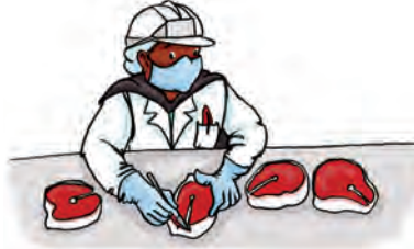
The veterinarian is inspecting meat to make sure it is safe to eat!