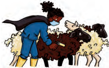
The veterinarian is vaccinating sheep!