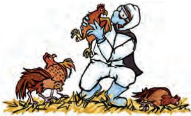
The veterinarian is investigating a disease outbreak so they can keep animals and people healthy!