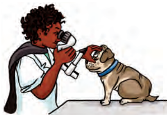
The veterinarian is examining the eyes of a dog!