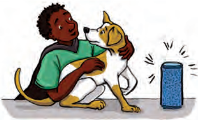
The veterinarian is helping a dog that is afraid of thunderstorms!