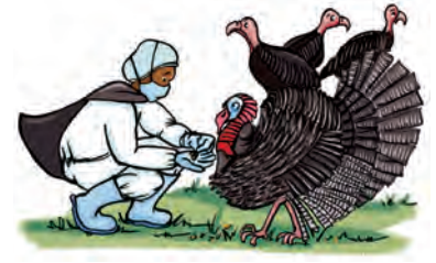
The veterinarian is keeping a flock of turkeys healthy!