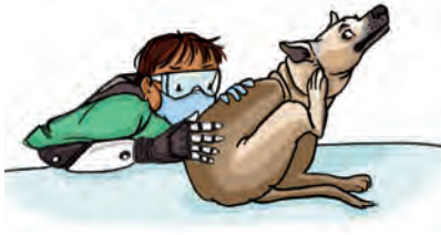
The veterinarian is checking the dog's skin to find out why it's itching!