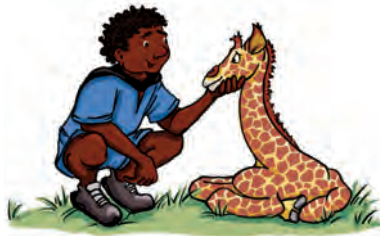
The veterinarian is examining a baby giraffe at the zoo!