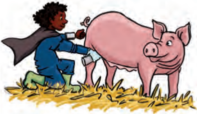
The veterinarian is using an ultrasound machine to check if the pig is pregnant!