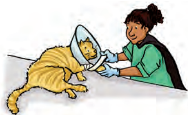
The veterinarian is bandaging the leg of the cat!