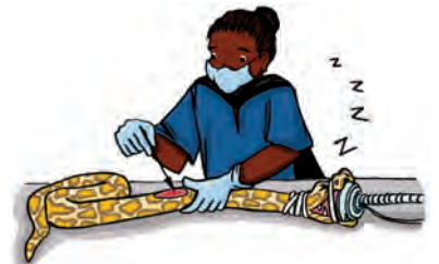
The veterinarian is operating on a rattlesnake!