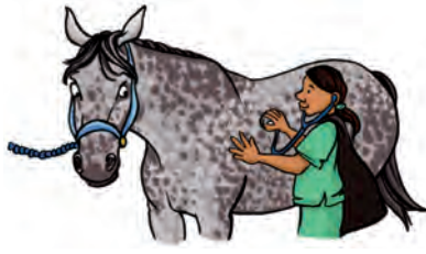
The veterinarian is using a stethoscope to listen to the horse breathe!