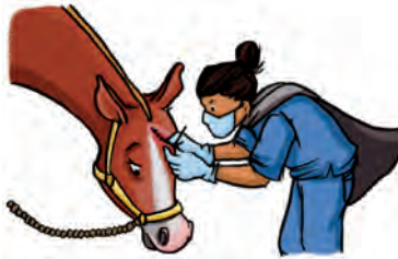
The veterinarian is putting stitches in a horse that cut his head!