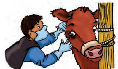
The veterinarian is operating on a cow's eye to remove a lump!