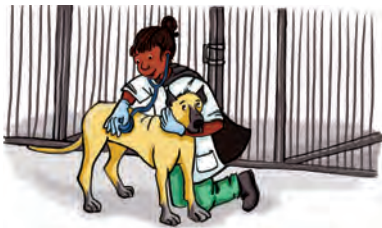
The veterinarian is taking care of animals at the animal shelter!