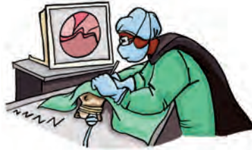
The veterinarian is operating on the dog's brain!