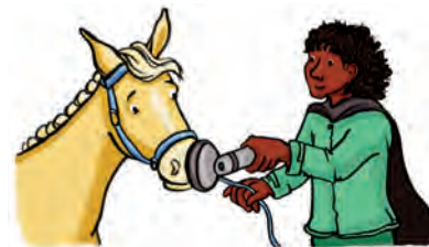
The veterinarian is treating a horse with asthma!