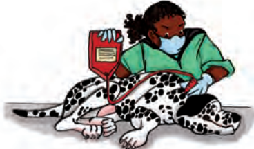
The veterinarian is giving blood to a dog that got hit by a car!