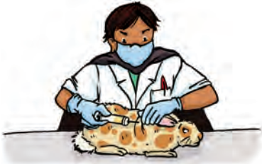
The veterinarian is giving the rabbit a vaccine!