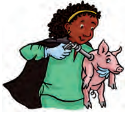
The veterinarian is using a syringe to vaccinate a pig!