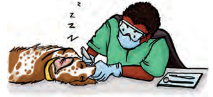
The veterinarian is pulling out a dog's tooth!