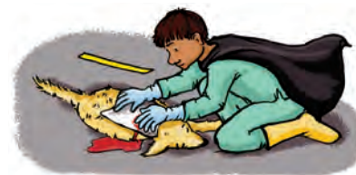
The veterinarian is saving a dog that got hit by a car!