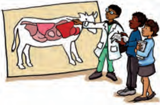
The veterinarian is teaching students the names of all the parts inside animals!