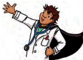
Go Vet!!! Act out the kind of veterinarian you want to be when you grow up. Ask everyone to guess what kind of vet you are and what you are doing!