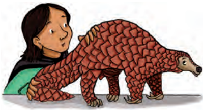
The veterinarian is saving rare animals from going extinct!