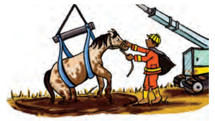
The veterinarian is rescuing a horse that is stuck in the mud!