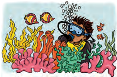
The veterinarian is saving the coral reefs in the ocean!