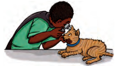
The veterinarian is examining inside the cat's ears!