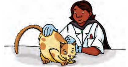
The veterinarian is examining a cat to see why it is not using the litter box!