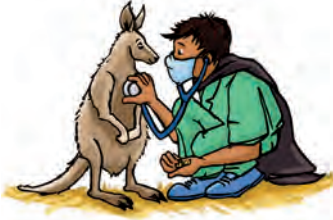
The veterinarian is using a stethoscope to listen to the kangaroo's heartbeat!