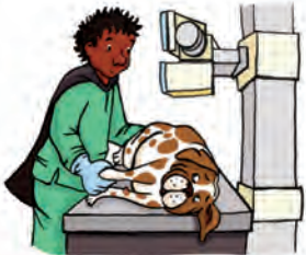
The veterinarian is taking a radiograph (x-ray) of the dog's broken leg!