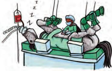
The veterinarian is operating on a horse with a bad bellyache!