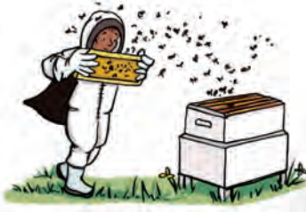
The veterinarian is helping sick bees in a hive!