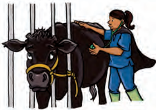
The veterinarian is using a stethoscope to listen to the cow's stomach noises!