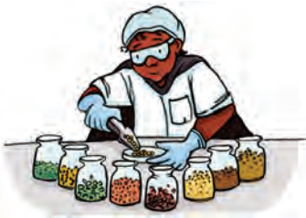
The veterinarian is inventing a special pet food to keep cats healthy!