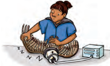
The veterinarian is fixing an owl's broken wing!