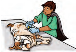
The veterinarian is saving a dog who ate chocolate! Chocolate makes dogs very sick!