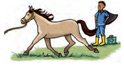
The veterinarian is watching a horse run to see if it is lame!