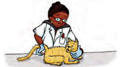
The veterinarian is using a thermometer to take the cat's temperature!