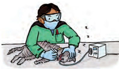
The veterinarian is cleaning the cat's teeth!