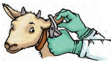
The veterinarian is putting an ear tag on a goat to identify it!