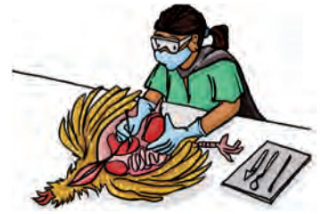
The veterinarian is looking inside a chicken to see why it died!