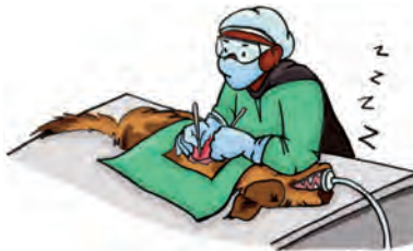
The veterinarian is doing surgery to fix the dog's heart!