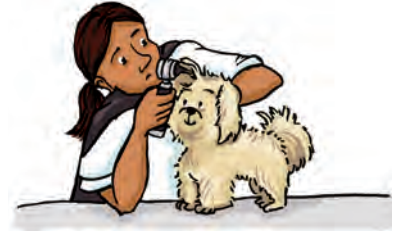
The veterinarian is examining inside the dog's ears!